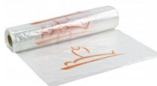
Part No: 125010 protective Cover