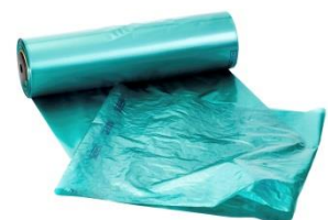
Part No: 125020 gliding cover