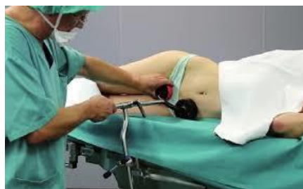
Positioning of the pelvis support